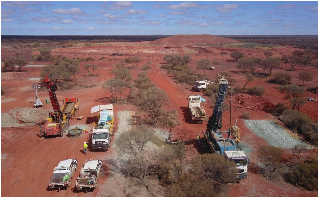
Figure 2. Drilling at Ulysses West.

A third drill rig is scheduled to arrive in September to progress in-fill and extensional drilling at Ulysses.